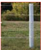
Columbus pg. 22