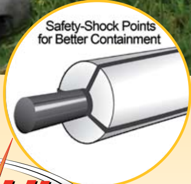
Safety-Shock Points for Better Containment

◀ Exclusive Sure-Fit® Safety Sleeves fit securely over standard metal t-posts