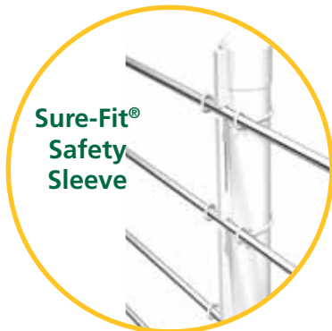
Sure-Fit® Safety Sleeve

White Lightning® installs like electric high-tensile wire and is engineered for durability, resistant to wear and withstands extreme temperature ranges. It is effective in high-tensile installations regardless of overall fence length.